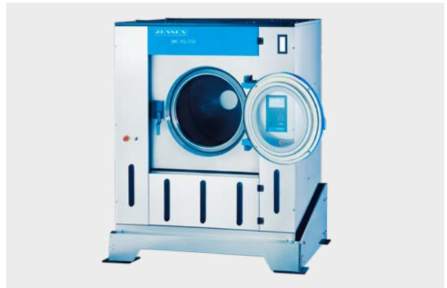
Easy loading and unloading with the wide-swing large loading door and the conical drum face.