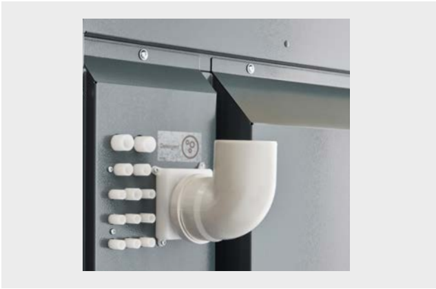
A liquid dosing connection on the backside of the washer extractors JWE 24/53, JWE 28/60 and JWE 40/90 with 13 connection points adds to the ease of use.