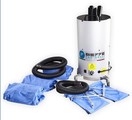
CARFON ref. BF350 DRYER FOR SEATS, MATTRESSES, CARPETS