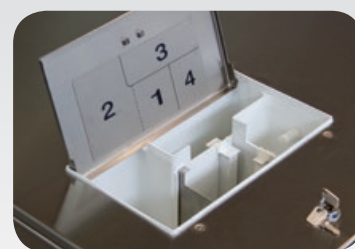
Internal dosing LS-332

HEATING ALTERNATIVES: Electric, Steam, No heating (external hot water supply)