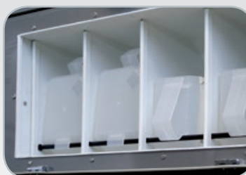
Internal dosing LS-355

Chemicals are always diluted beforehand in the collector to avoid damaging fabrics by direct contact.